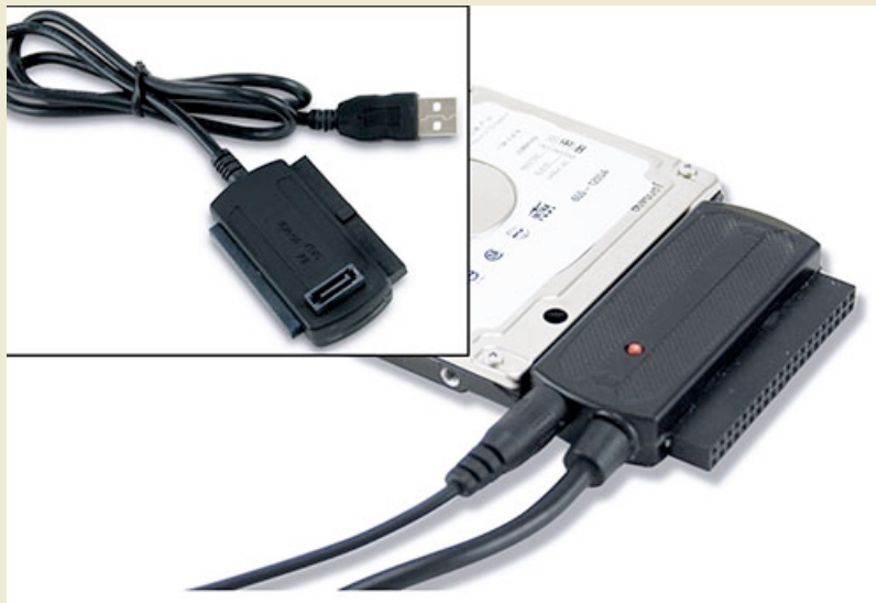
Two views of the NewerTech USB 2.0 Universal Drive Adapter.

For more info, visit www.macsales.com/u2hd