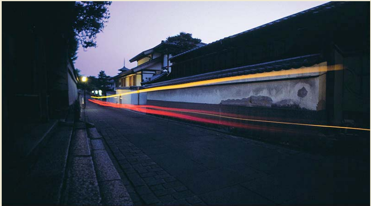
"Ryokan Highway" Pigment print

From the series, Approaching Nirvana: A Modern Day Look at the Influence of Buddhism in Japan . This was a handheld exposure of about six seconds, though I'm not sure because it was shot on 35mm transparency film. Remember those days? I'm sure many of our readers are still happily using film and that's great. This image was shot at the end of a long day of temple and shrine exploring in Kyoto, Japan. The lights are coming from a taxi moving from right to left in the frame.